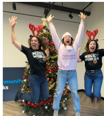
Yellowhead Team in Their Ugly Holiday Sweaters

In December, Taseko teams went head to head in the Ugly Holiday Sweater Showdown – Team Edition.