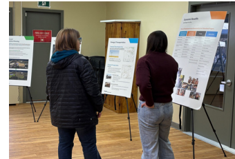
Coffee and Conversation event in Clearwater

On February 19, 2026, the Yellowhead Project team hosted a Coffee and Conversation event at the Dutch Lake Community Centre in Clearwater.