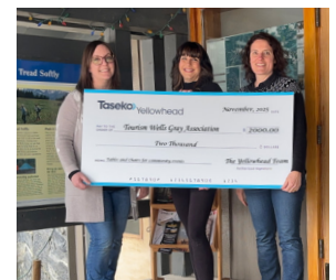
Yellowhead presenting cheque to Tourism Wells Gray – tables and

Teams from Taseko’s head office, Gibraltar, Flsorence Copper, and Yellowhead competed to see who could earn the most social media votes. For every vote received, $1 was donated to local food banks. In the end, the award was shared evenly and the Barriere and Clearwater food banks each received $159.50.