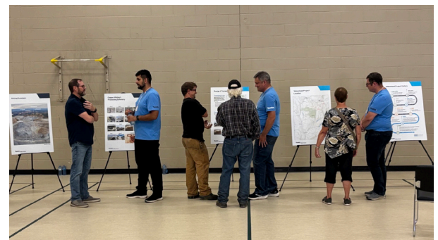
Taseko members (in blue) speaking to community members.

The next step in the Early Engagement phase is to submit the Detailed Project Description to the BC EAO. The DPD will be used to advance the Readiness Decision phase, which determines whether the project is ready to enter into the EA process. This step is followed by the Process Planning phase which defines how the assessment will be undertaken, including confirmation of the application information requirements for the assessment. The Process Planning phase includes a public engagement and comment period.