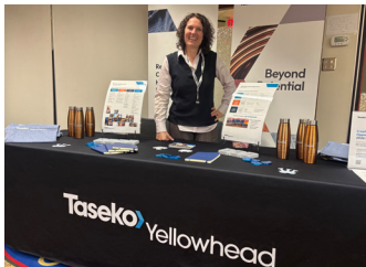
WorkBC Career Fair Barriere, March 19, 2026

The event aimed to introduce students and job seekers to local employment opportunities and educate them about potential career paths, while highlighting how school interests and skills can connect to future roles across industries, including mining and natural resources.