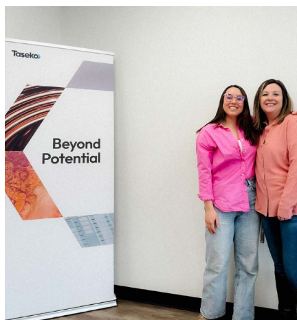
Pink Shirt Day

In February, the Yellowhead Team wore pink shirts in support of Pink Shirt Day, standing together against bullying and promoting kindness and inclusion.