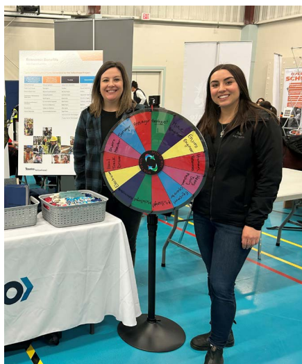
Simpco Career Fair

Yellowhead was proud to support and take part in a number of community events over the past few months: