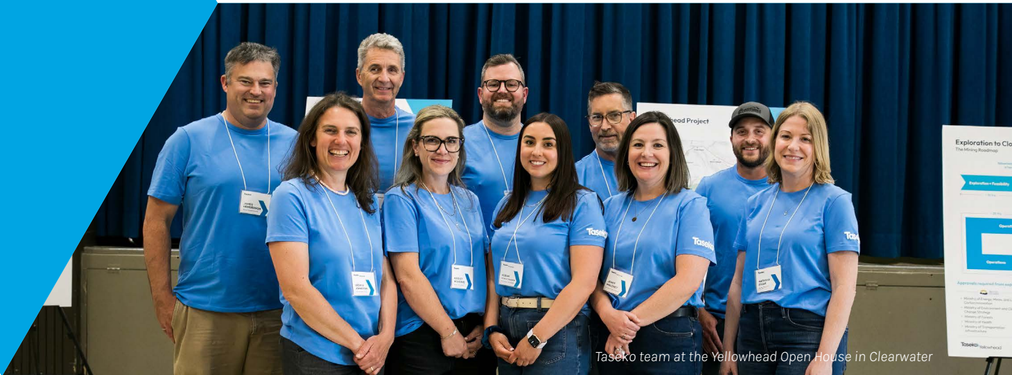
Taseko team at the Yellowhead Open House in Clearwater