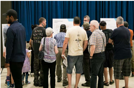
Yellowhead Open House, held in Clearwater

We had a great time connecting with community members at our recent open houses for the Yellowhead Project in Vavenby, Clearwater and Barriere!