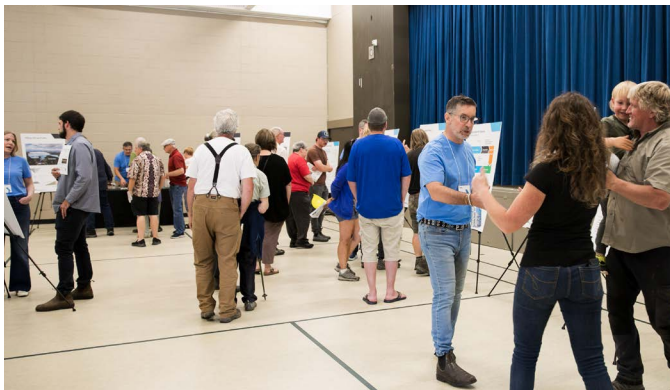
Clearwater open house

For more information, visit: bit.ly/Yellowhead-EPIC