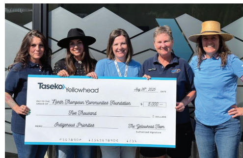
The Yellowhead Project team presents a $5,000 cheque to the North Thompson Communities Foundation.

Through our Beyond Potential Community Investment Program, we are proud to support the North Thompson Communities Foundation with a $5,000 contribution under the Indigenous Priorities Focus Area.