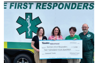
Top row: Barriere and Area Chamber of Commerce with the "Amazing Race 2.0" Bottom row left: Raft Mountain Skating Club Bottom row middle: Clearwater Rotary Club – Golf Tournament Bottom row right: Barriere First Responders Society